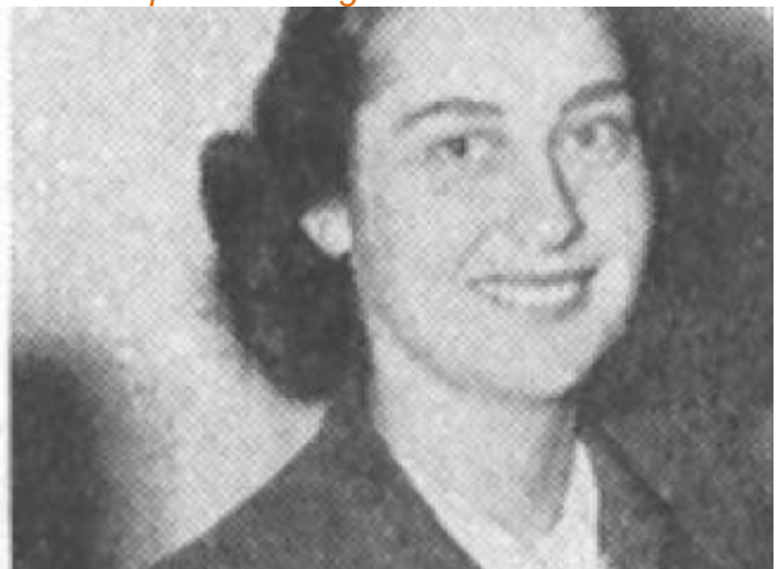
Eleanor Kolchin/Huffington Post

When Eleanor Kolchin worked at IBM in the late 1940s she had to keep her marriage a secret.